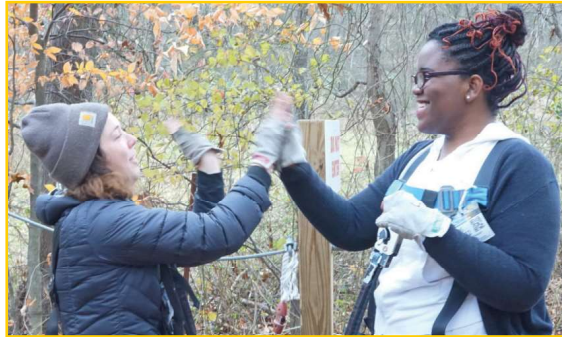
High fives after conquering a route at the adventure park.